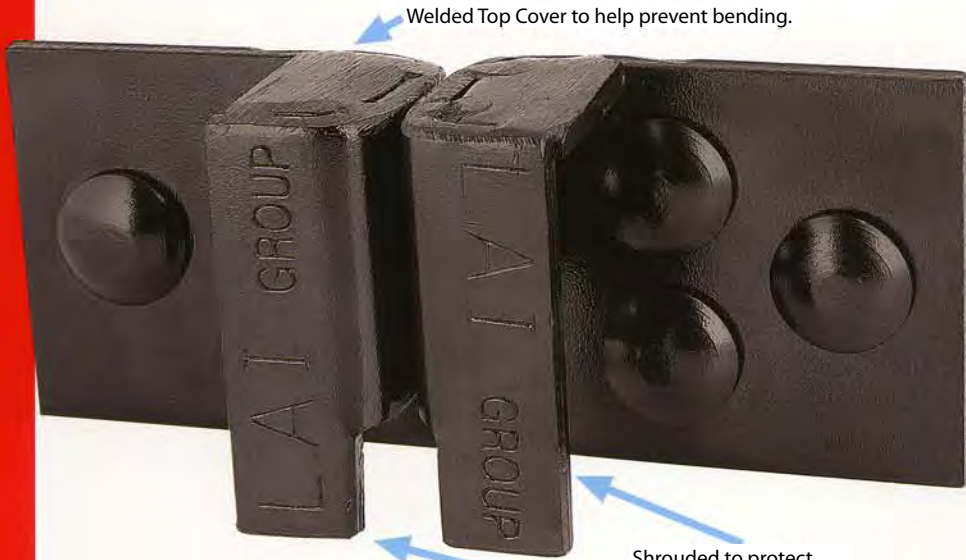
Welded Top Cover to help prevent bending.