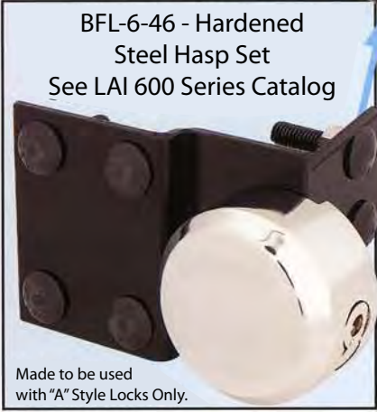
BFL-6-46 - Hardened Steel Hasp Set See LAI 600 Series Catalog

Made to be used with "A" Style Locks Only.