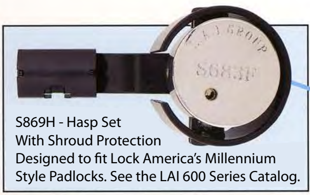
S869H - Hasp Set With Shroud Protection Designed to fit Lock America's Millennium Style Padlocks. See the LAI 600 Series Catalog.