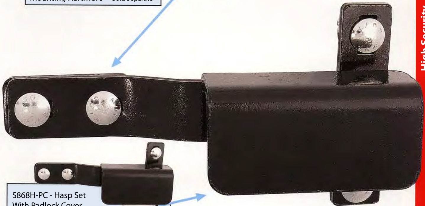
S868H-PC - Hasp Set With Padlock Cover For use with shackle type padlocks. Designed for use with 500 and 600 series LAI Padlocks.

**Made to use with Shackle style Padlocks