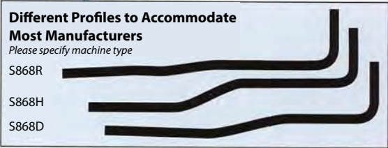
Different Profiles to Accommodate Most Manufacturers Please specify machine type