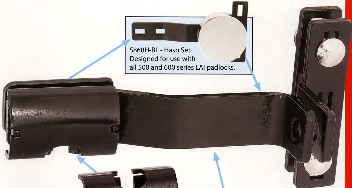
S868H-BL - Hasp Set Designed for use with all 500 and 600 series LAI padlocks.