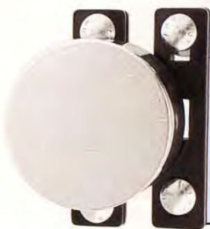
S820T - Hasp Set (special application)

Accommodates all 500 and 600 Series LAI Padlocks. See page 3 of this catalog or LAI Series 600 catalog.