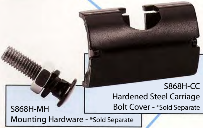
S868H-MH Mounting Hardware - *Sold Separate S868H-CC Hardened Steel Carriage Bolt Cover - *Sold Separate