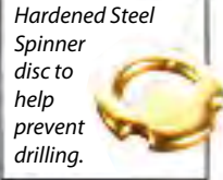
Hardened Steel Spinner disc to help prevent drilling.