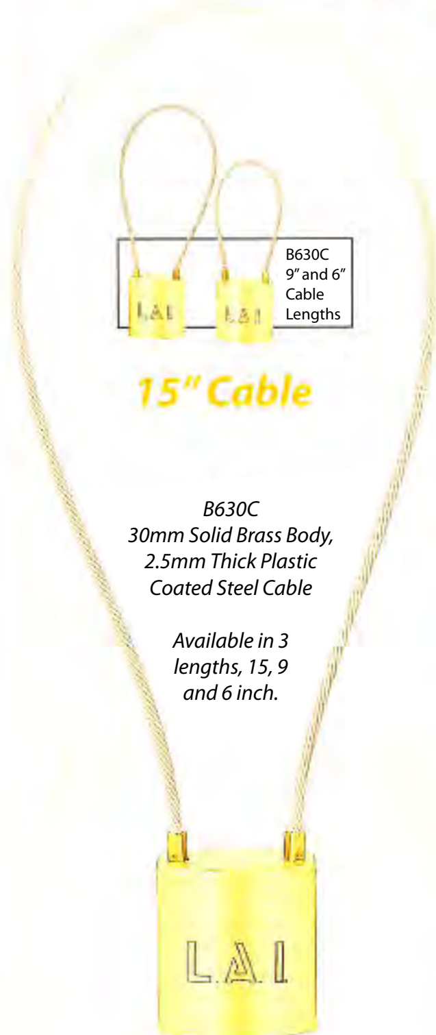
B630C 9" and 6" Cable Lengths