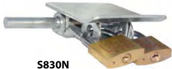
S830N With Two B745C padlocks