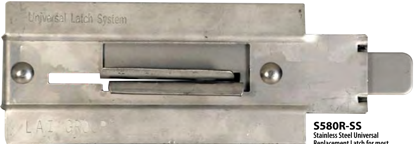
S580R-SS Stainless Steel Universal Replacement Latch for most Self-Storage Doors with flat or rounded peaks.