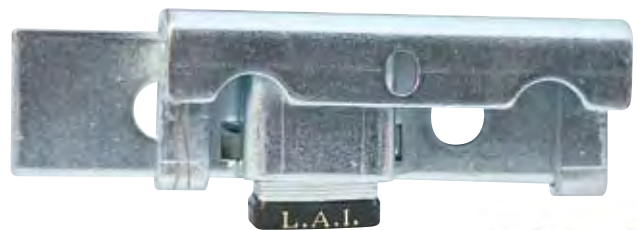
Ultra Latch with L740J Laminated Steel Padlock