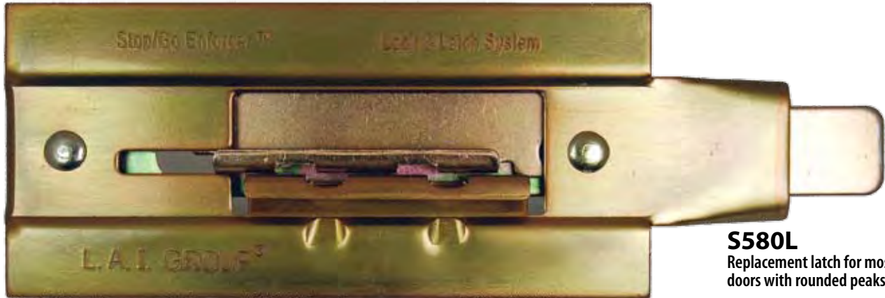
S580L Replacement latch for most self-storage doors with rounded peaks.