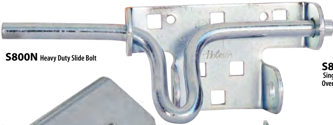
S800N Heavy Duty Slide Bolt