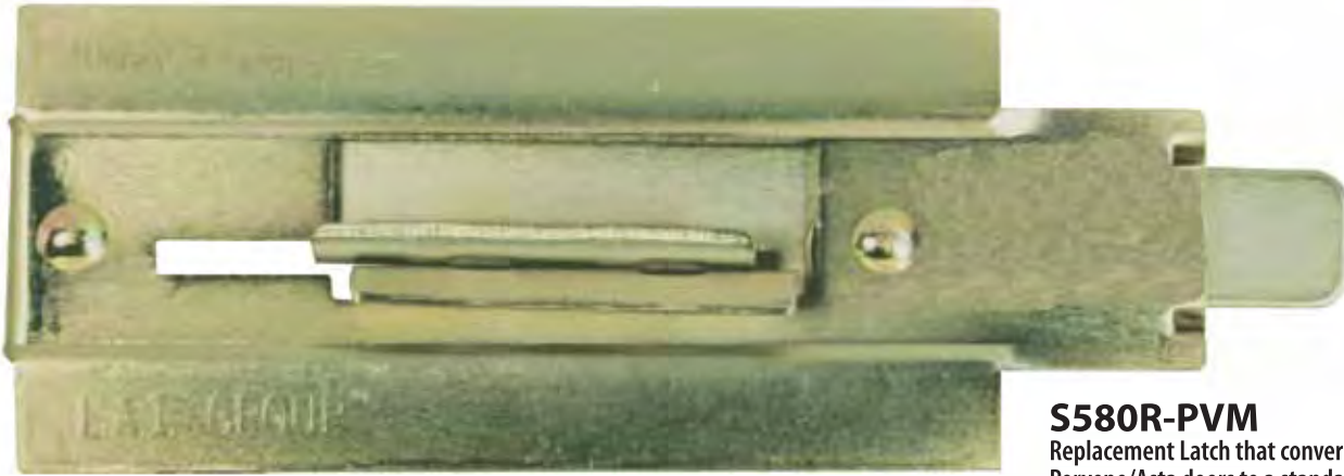
VALLEY MOUNT FOR PORVENE/ASTA

S580P Replacement Latch that converts Porvene/Asta doors to a standard two padlock system by mounting this latch on the Peak or Ridge of the door.