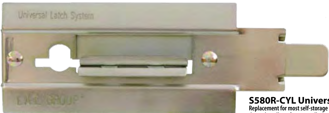
S580R-CYL Universal Replacement for most self-storage doors that allows for two padlock system plus a Lock America 19mm cylinder lock.