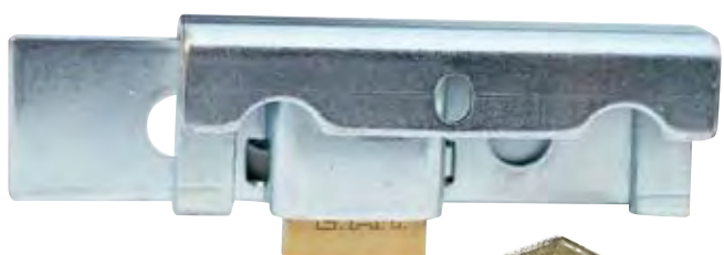
Ultra Latch with B640A Master Keyed Brass Padlock