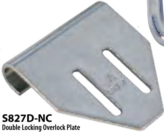
S827D-NC Double Locking Overlock Plate