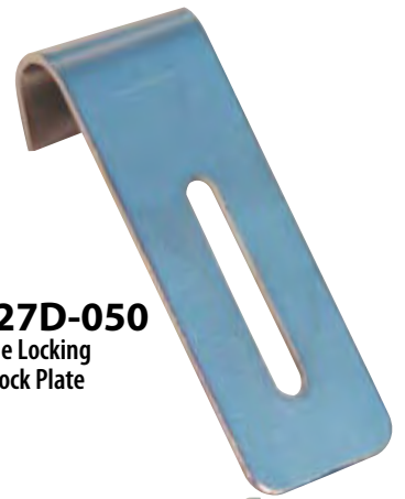
S827D-050 Single Locking Overlock Plate